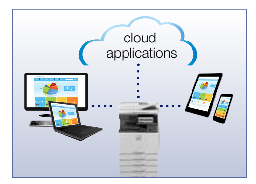
Access popular cloud applications, distribute files and print documents more easily.