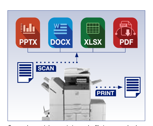
Scan and convert documents to popular file types seamlessly with Sharp's built-in OCR function.