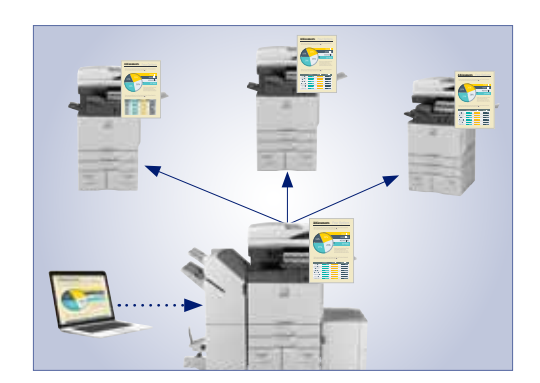
Standard Serverless Print Release enables users to securely print a job and release it from up-to six supported models on the same network.